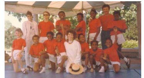
St. Louis Arches 1989- Science Center